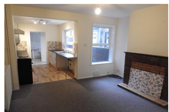
London Road, Gisleham Lowestoft NR33 7PG

A well presented 3 bedroom cottage situated to the South of Lowestoft in sought after Gisleham. The property is in good decorative order and comprises: Lounge, dining room, modern kitchen & bathroom, gas heating to radiators, double glazing, 2 x off street parking spaces and gardens